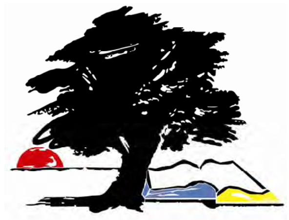
Study Manitoba School Divisions

For more information, please contact either: