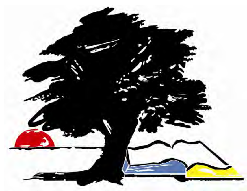
Study Manitoba School Divisions